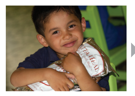
STEP 3 Charity partners distribute the VitaMeal to those that need it most.