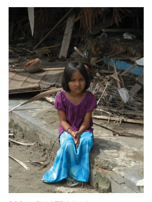
2004 ASIAN TSUNAMI 3 million VitaMeal servings delivered

Millions of donated VitaMeal® servings nourish people whose lives have been thrown into chaos by disasters. Many have lost their homes, their work and family members. They are left destitute with nowhere to go and nothing to eat. Nourishing VitaMeal saves them from starvation, malnutrition and helps them combat disease as they rebuild.