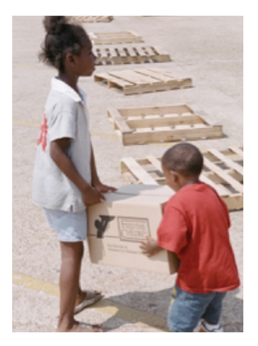
2005 HURRICANE KATRINA 700,000 VitaMeal donations delivered