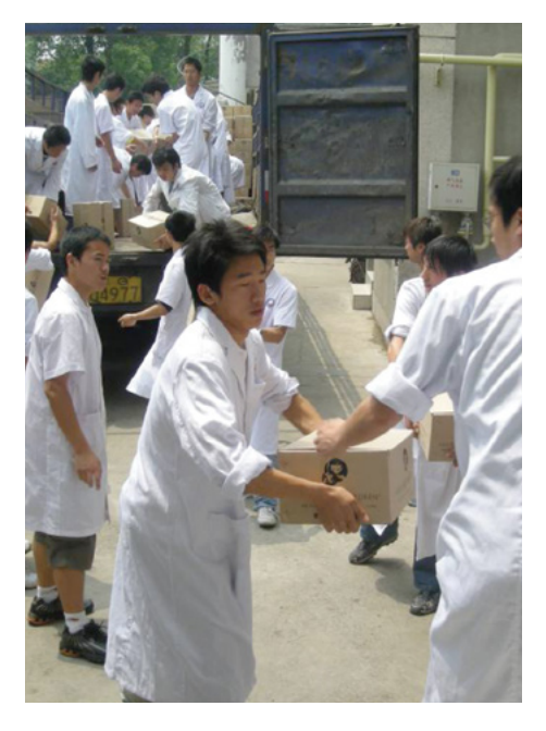
2008 SICHUAN CHINA EARTHQUAKE 6 million VitaMeal servings delivered

Visit nourishthechildren.com to learn how.