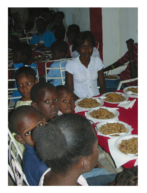
2010 HAITI EARTHQUAKE Over 1 million servings delivered