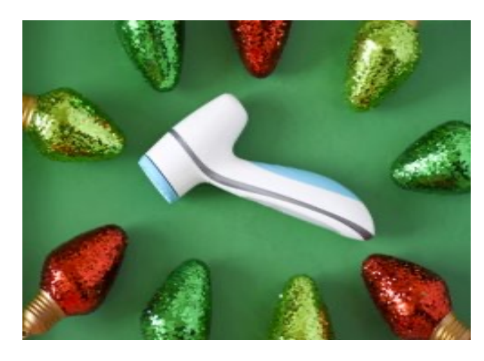
Need a little extra Christmas cash this year? Message me to learn how!

#nuskinbrandaffiliate #supplementalincome #opportunity #beautyandwellness #empowerme