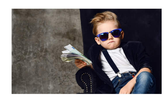
I've easily been able to earn $450 in passive income each month working only from my phone. Reach out to learn more! #nuskin #freedom