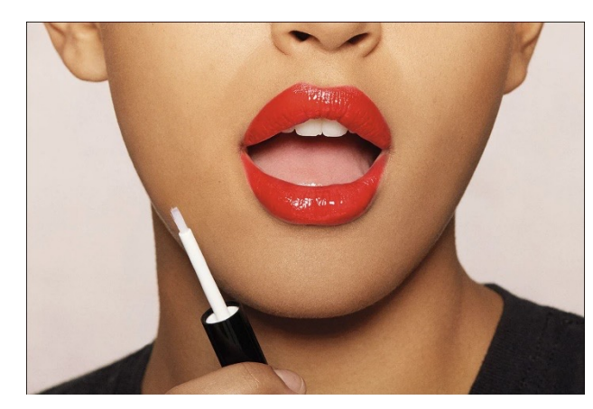
Something about white teeth and longlasting lipstick really toots my horn!

7 months ago I made the smartest decision I could have ever made! And this whole biz is free to join!